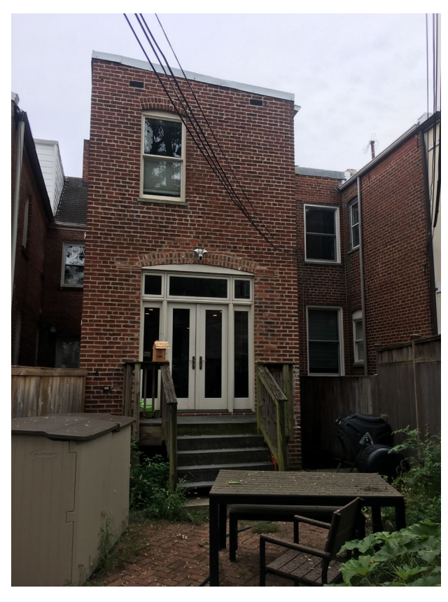
EXISTING REAR FACADE