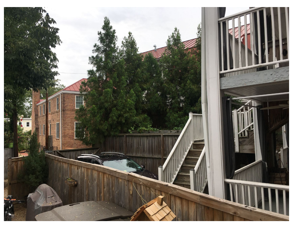
VIEW FROM REAR YARD LOOKING NORTHEAST