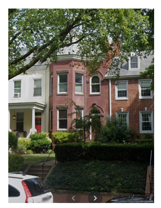
EXISTING FRONT FACADE