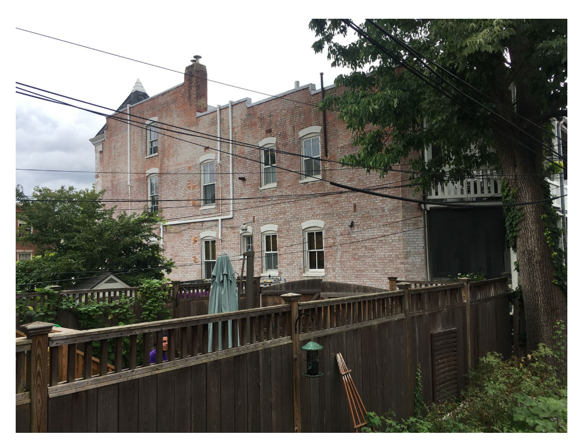
VIEW FROM REAR YARD LOOKING NORTHWEST